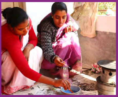
UN Sustainable Development Goals 20: